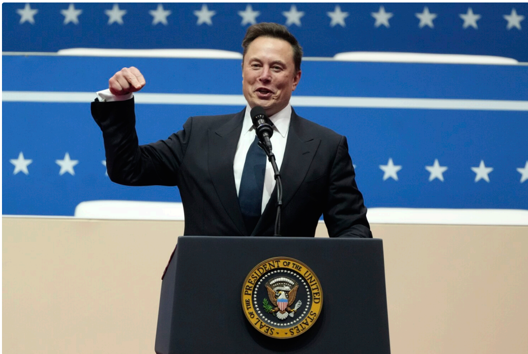
Elon Musk creates confusion about IRS' Direct File – but the free tax program is still available