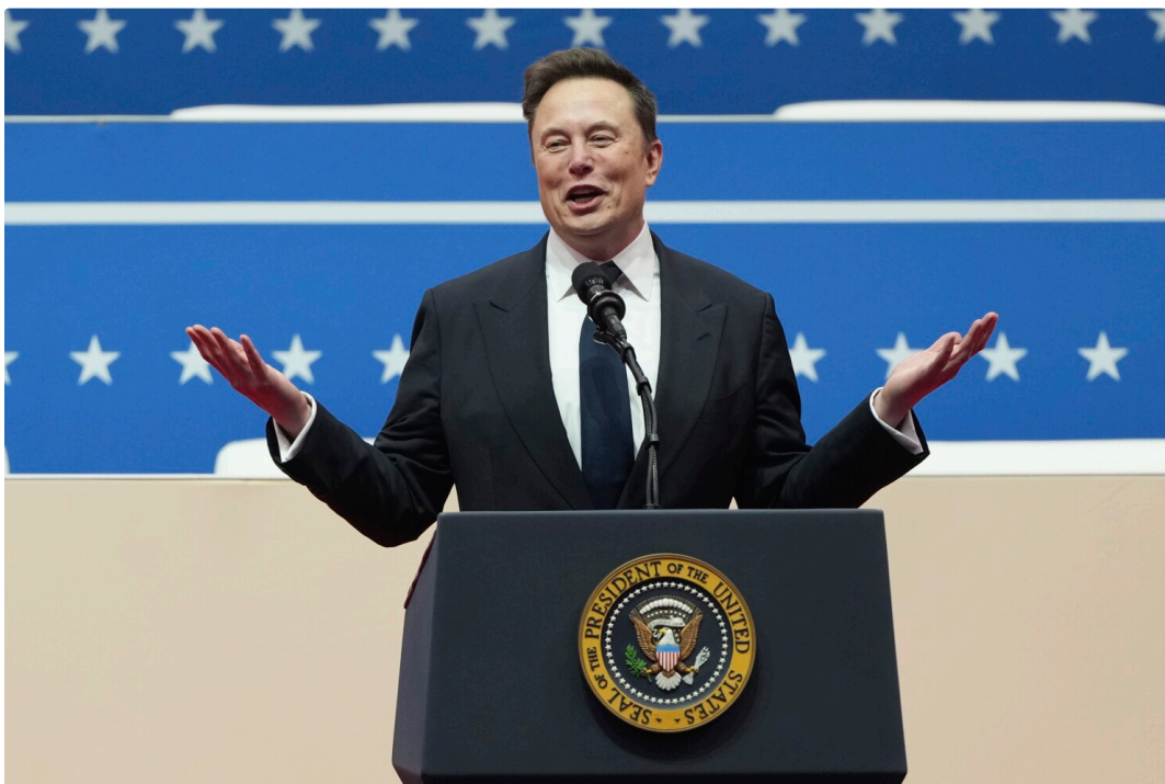
Democrats ask for an investigation into DOGE's access to Treasury's payment systems

“DOGE will continue to shine a light on the fraud they uncover as the American people deserve to know what their government has been spending their hard earned tax dollars on,” he said.