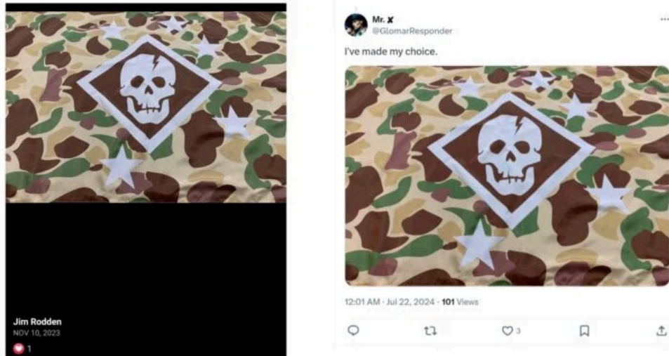
LEFT: A SCREENSHOT OF THE M1942 “FROG SKIN” CAMO FLAG IMAGE POSTED AS JIM RODDEN’S FACEBOOK BANNER. RIGHT: A SCREENSHOT OF GLOMARRESPONDER’S POST FEATURING THE SAME M1942 FROGSKIN CAMO FLAG IMAGE

The Facebook account also features a banner image depicting an M1942 “Frog Skin” camo flag with an atypical cracked-skull Marine Raiders emblem that was updated in November 2023. In July 2024, GlomarResponder posted the same photo. The flag is an uncommon variant that was previously sold on a website called Paid to Raid but is no longer listed among their products. Reverse image searches for the photo of the flag do not turn up any other exact matches outside of Paid to Raid’s webstore.