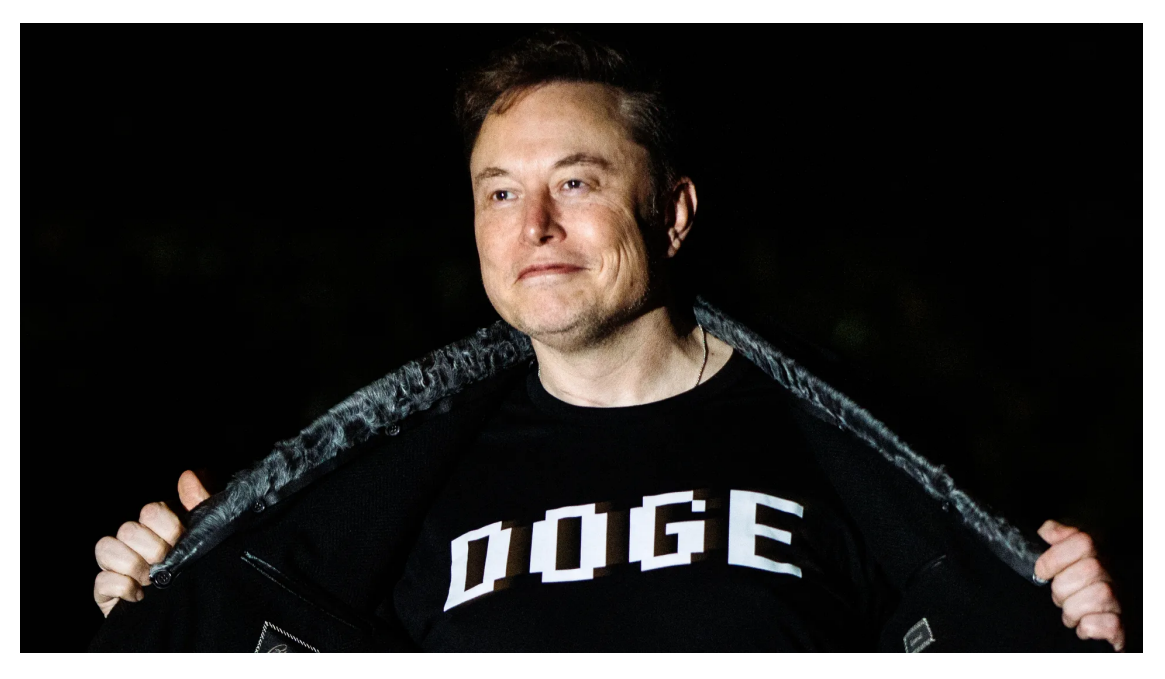
White House senior adviser Elon Musk, shown last week on the South Lawn.

<u>Elon Musk</u>'s political action committee is offering Wisconsin voters $100 to sign a petition expressing their opposition to "activist judges," a cause that <u>President Trump</u> is pressing as judges block or delay several parts of his agenda.