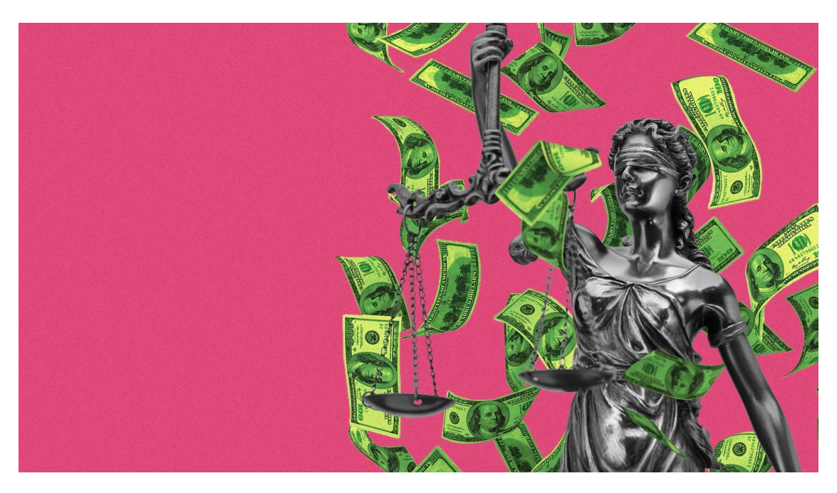
Illustration: Lindsey Bailey/Axios

The battle over a single <u>state Supreme Court seat in Wisconsin</u> is on track to be among the most expensive judicial races in history, fueled by donations from big fundraising names such as Elon Musk and George Soros.